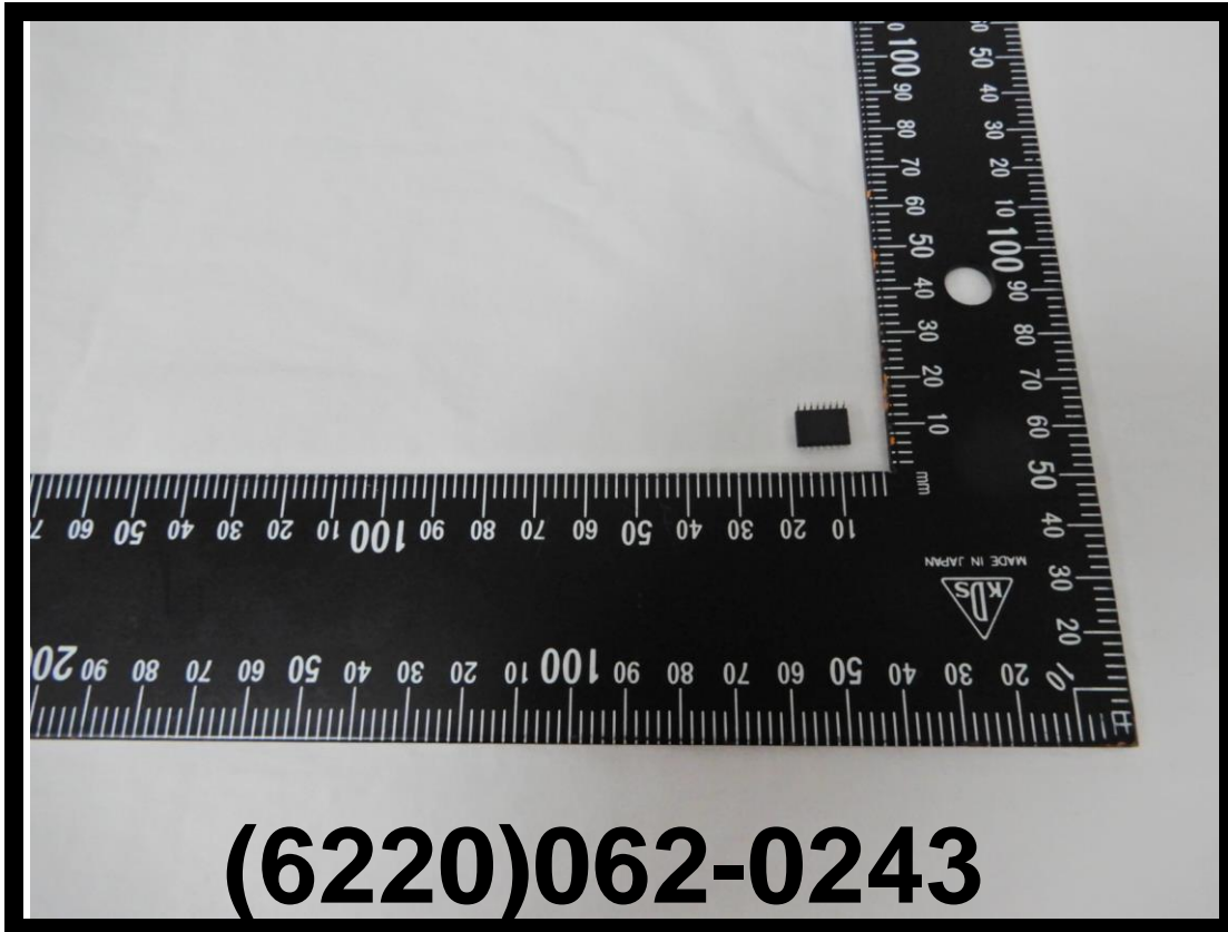
Photo of the Submitted Sample 委送样品照片

Lab No. : (6220)062-0243 Date : March 10, 2020 Page : 7 of 10