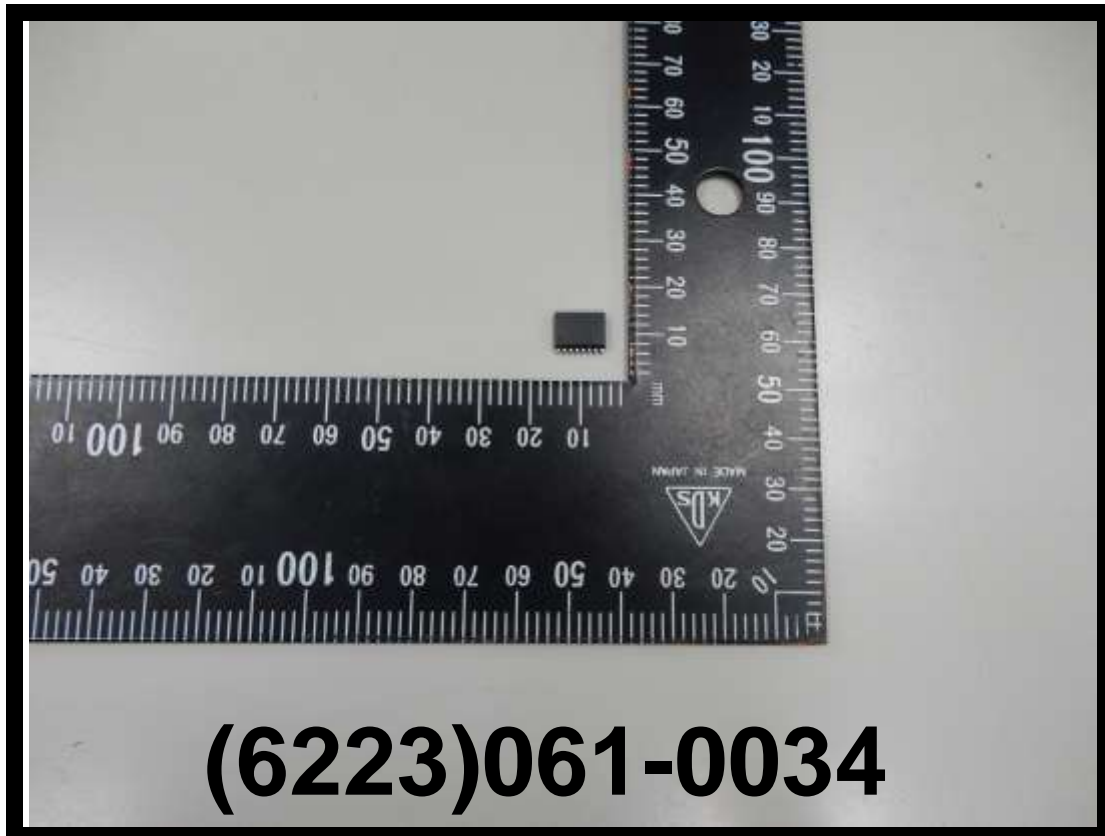
Photo of the Submitted Sample 委送樣品照片