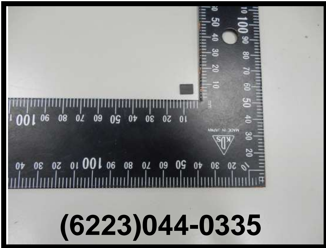
Photo of the Submitted Sample 委送樣品照片