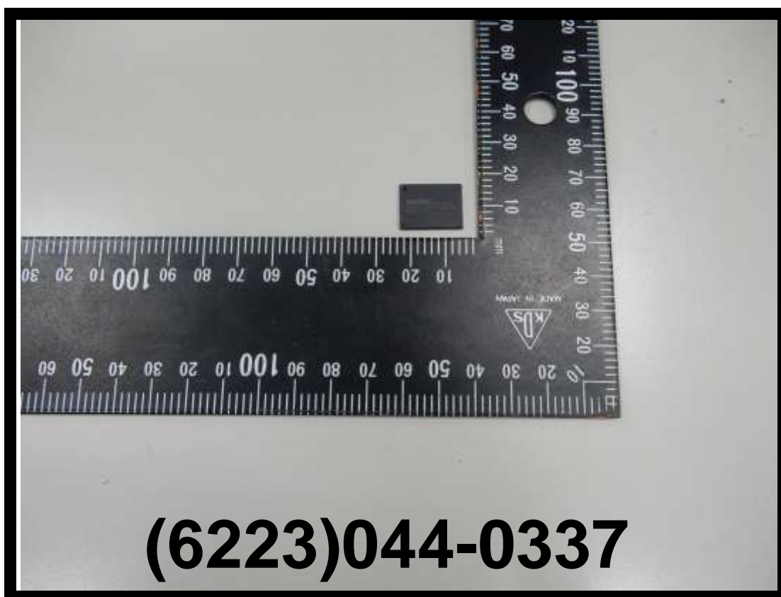
Photo of the Submitted Sample 委送樣品照片