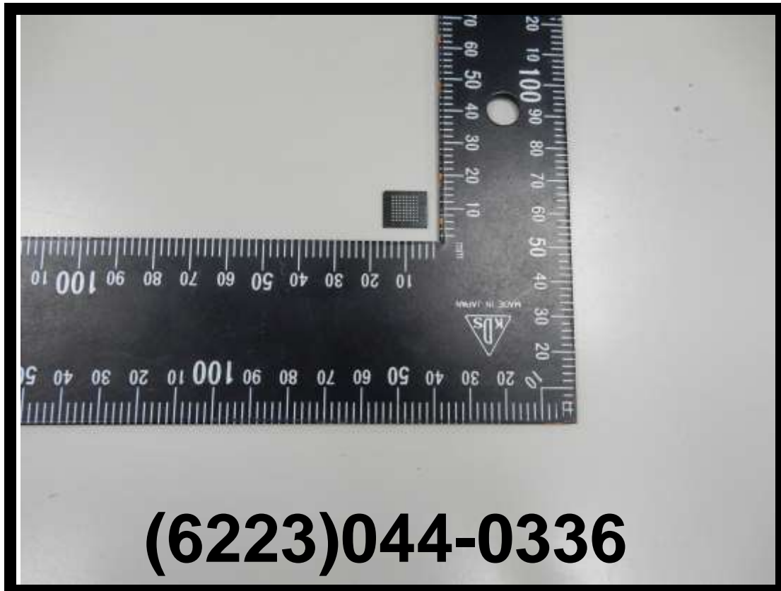
Photo of the Submitted Sample 委送樣品照片