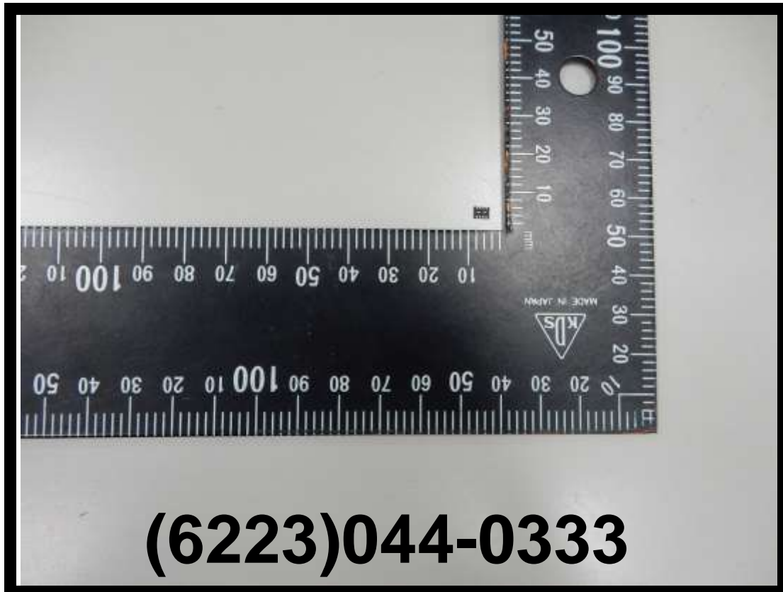
Photo of the Submitted Sample 委送样品照片