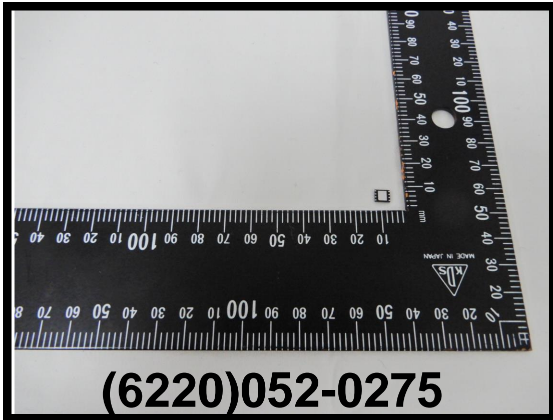
Photo of the Submitted Sample 委送样品照片

Lab No. : (6220)052-0275 Date : March 03, 2020 Page : 7 of 10