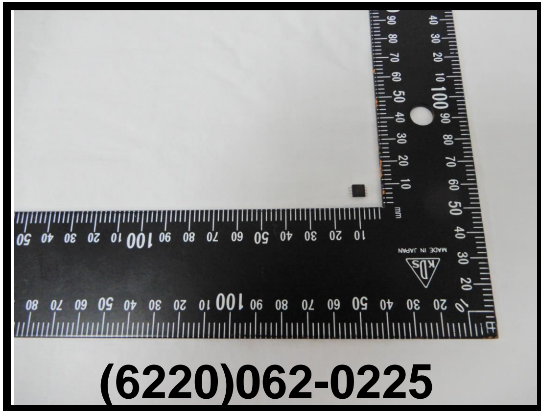
Photo of the Submitted Sample 委送样品照片

Lab No. : (6220)062-0225 Date : March 10, 2020 Page : 7 of 10